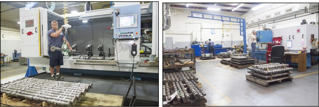
Left: Large CNC Camshaft Grinder for camshafts up to 100" in length. Right: Hillcrest Camshaft Production Grinding for the Over-the-Road Truck Engines.

Being in business for nearly 60 years, Hillcrest Camshaft has become a world leader in the remanufacturing of industrial camshafts. Don't trust any company with your diesel engine camshafts, call the experts at Hillcrest Camshaft. With over 150 years of combined camshaft experience, we use some of the most state of the art test-ing and grinding equipment today.