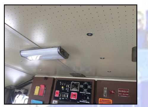
Ceiling Repair Kit fig 1